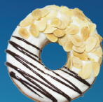
Vanilla Choc Almond