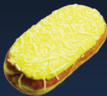
Cheezy Pisang Goreng